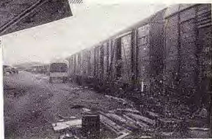
DREUX — FRANCE